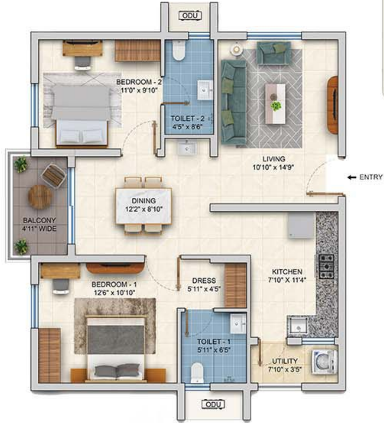
1210 - EAST