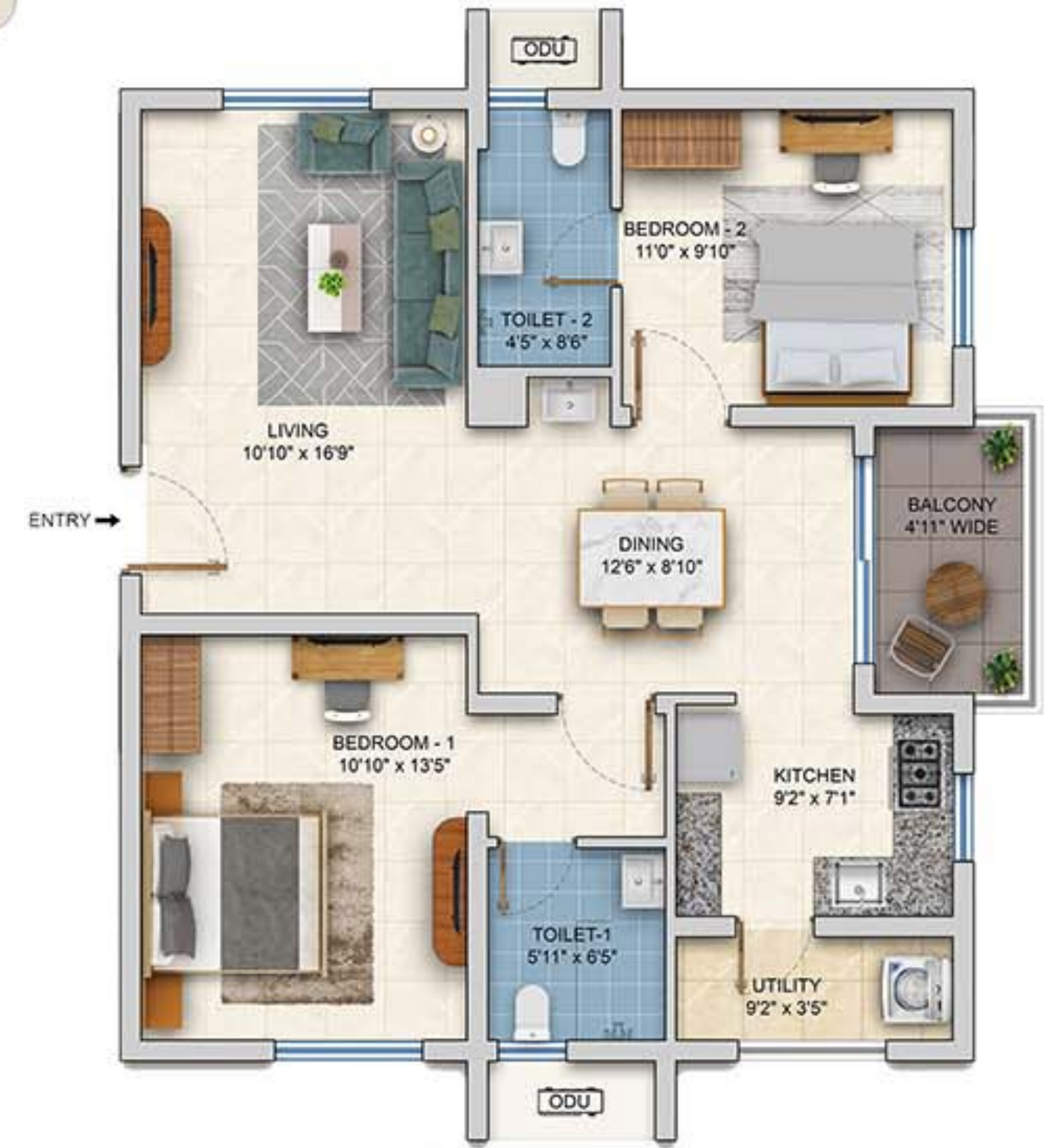
1210 - WEST