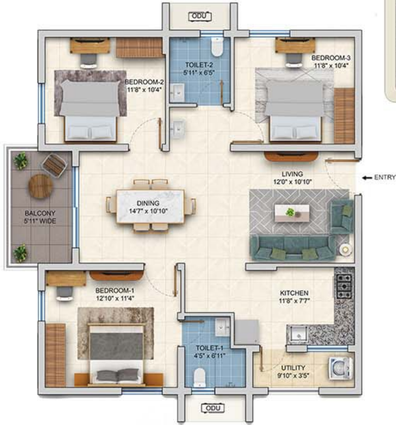
1475 - EAST