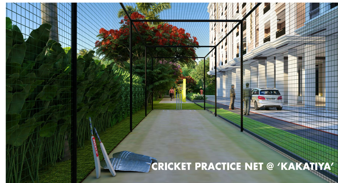
CRICKET PRACTICE NET @ 'KAKATIYA'