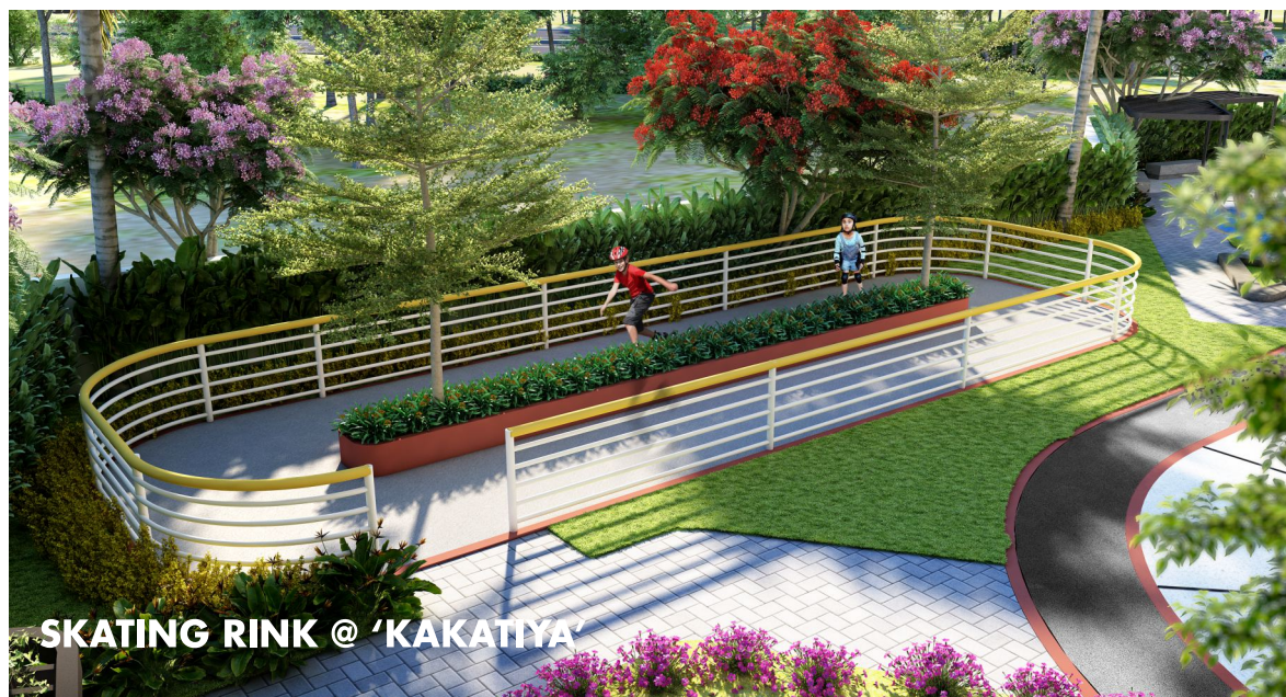
SKATING RINK @ 'KAKATIYA'