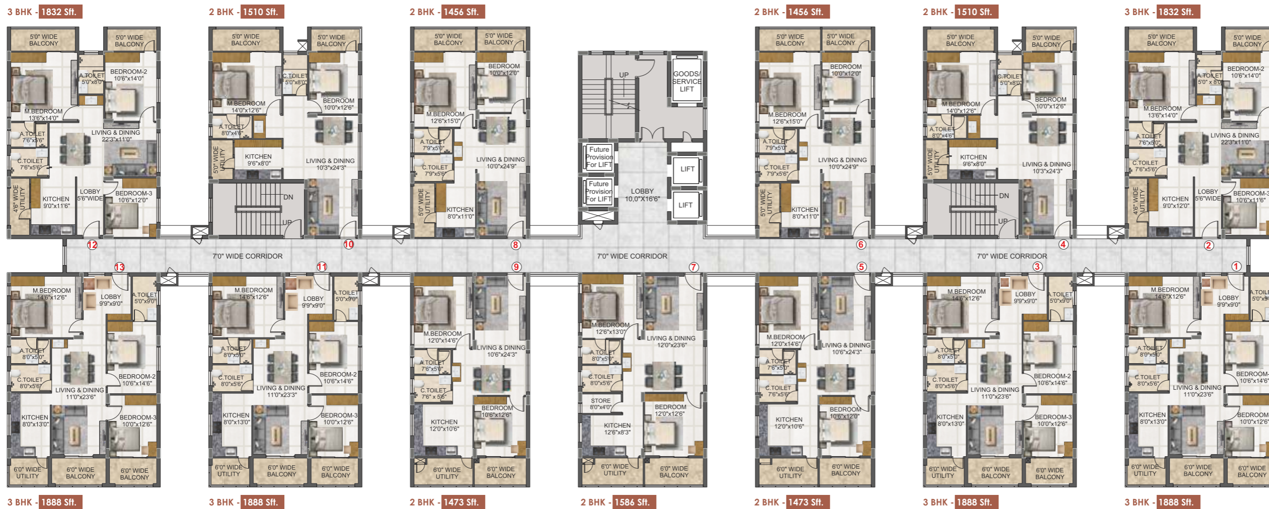
TYPICAL FLOOR PLAN 2 nd TO 12 th FLOOR